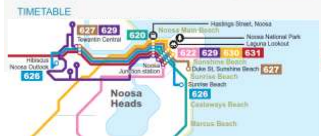
Noosa Bus Network

BYES: In rounds 1 to 5, up to 2 byes are permitted.